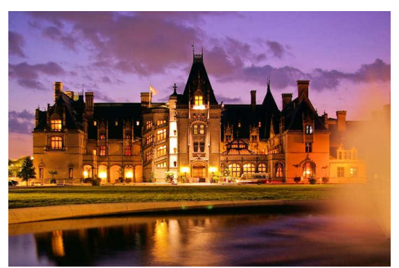
Biltmore Estate in Asheville, North Carolina An optional site visit during the 2020 League Symposium.

Welcome to the November issue of The League News! It's time to book your travel to Asheville, North Carolina. We are looking forward to seeing you at the 2020 League Footing Academy (Jan. 17-18) at the WNC Agricultural Center and the 2020 League Symposium (Jan. 19-22) at the Crowne Plaza Asheville.