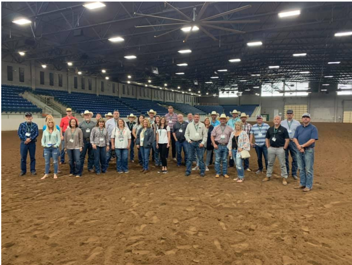
The League Members in Salt Lake City. UT

Thank you to all our members and sponsors who joined us this summer in Salt Lake