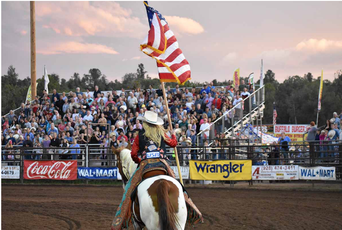
The World's Oldest Continuous Rodeo at the Payson Multi-Event Center