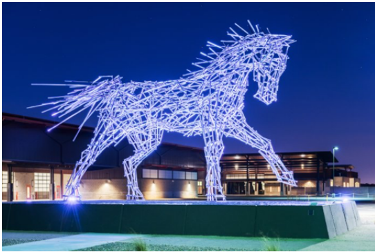
WestWorld of Scottsdale