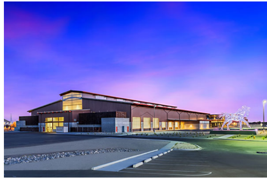
WestWorld's North Hall